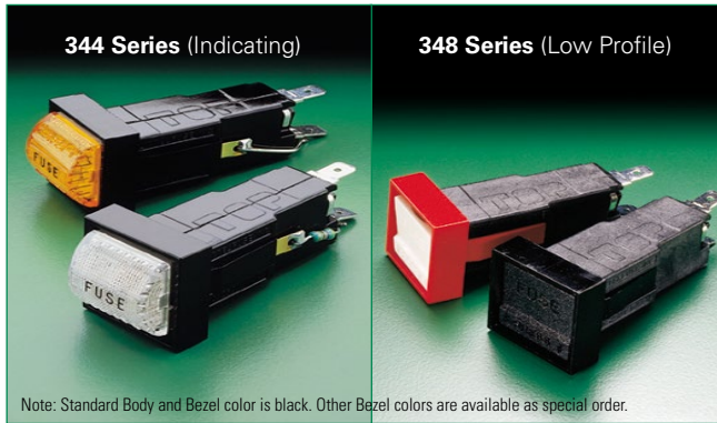
Note: Standard Body and Bezel color is black. Other Bezel colors are available as special order.