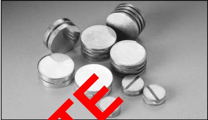
Characteristics @25°C case temp (unless otherwise noted)