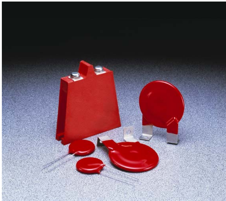
Figure 1 – Various MOV Packages available

While common disc sizes range from 5mm to 60mm, for the purpose of this discussion, a large MOV is defined as one incorporating a 32mm, 34mm square, or 40mm disc (Figure 1). A small varistor is defined as a 14 or 20mm disc since these are usually the smallest practical size for most commercial AC Mains equipment. A first-order comparison of these disc sizes is made in Table 2 for the 250VAC (RMS) working voltage types.