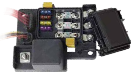
PN 880075 with remote switching