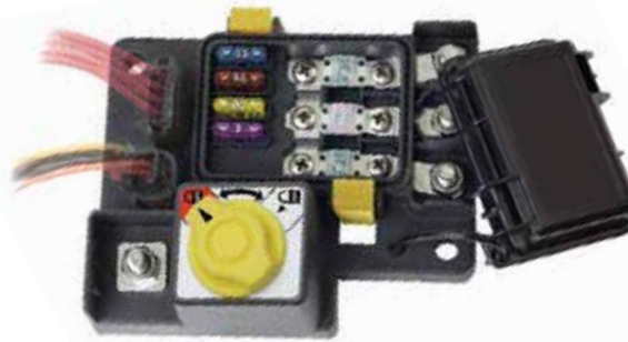
PN 880076 with remote switching and manual control