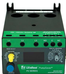
Figure 1. The 777 KW/HP-P2

Bee Cave Drilling is a residential and commercial water well driller located in Dripping Springs, Texas. They drill the well and install the well casing, pump and auxiliary equipment that delivers a complete solution that is exactly what their customers are looking for—water. With drought conditions occurring across several areas of the US and residences and businesses relocating to remote areas outside of city water limits, providing water to these areas is a growing business for Bee Cave Drilling.