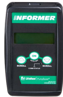
Figure 3. Littelfuse Informer

Blair also uses a Littelfuse hand-held diagnostic tool called the Informer. The Informer allows him to go to any panel with an installed single-phase PumpSaver and wirelessly download the past 20 fault causes. This product aids in determining and resolving the issue.