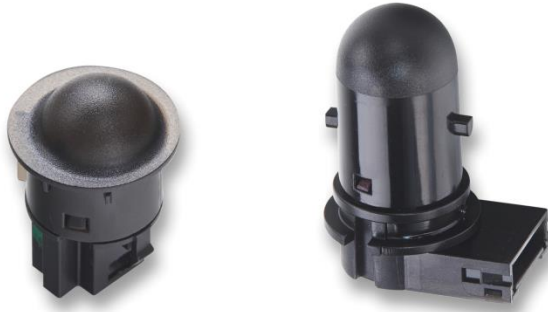
Figure 1: Solar Sensors