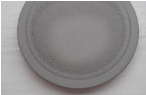
Figure 3: Initial evidence of thermal cycling scrubbing on the anode molybdenum contact