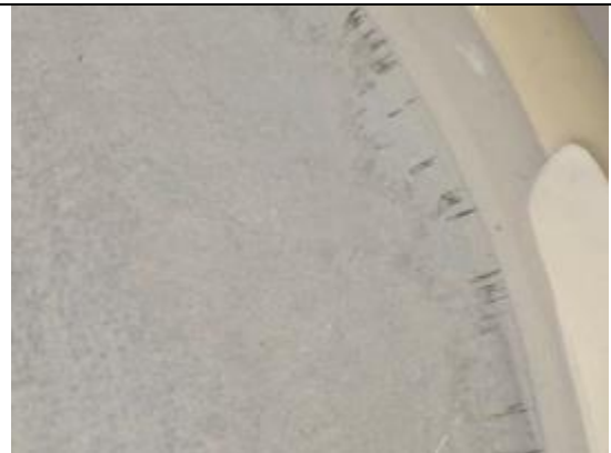
Figure 2: Initial evidence of thermal cycling scrubbing at the edge on the cathode contact area