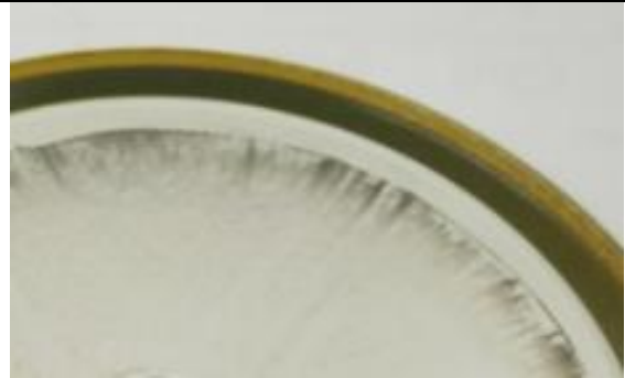
Figure 4: More extensive evidence of thermal cycling scrubbing at the edge on the cathode contact area