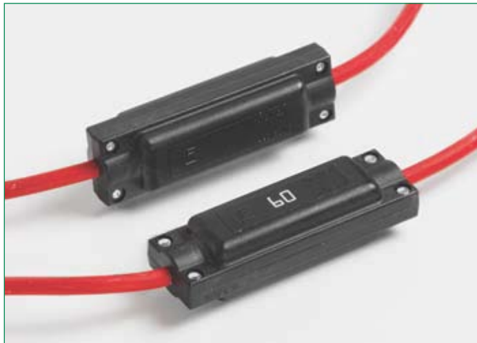
The CablePro® fuse was designed to replace both the fusible link in a harness, and the whole high-current cable to which it is attached.

The Littelfuse CablePro® fuse (Fig. 1) was designed to replace both the fusible link in a harness or high current fuses with a holder, and the whole high-current cable to which it is attached. It can be used to replace any cable where high current protection is needed, but there are limited locations for the fuse and holder.