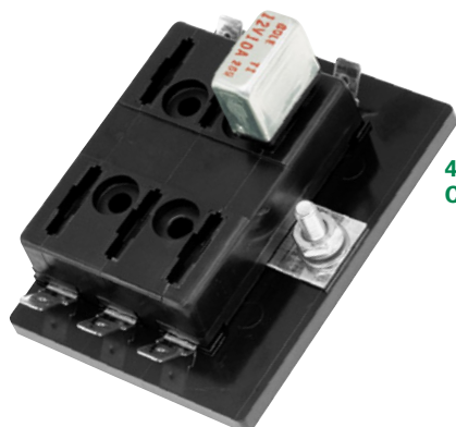
46377-6 Common Hot Feed