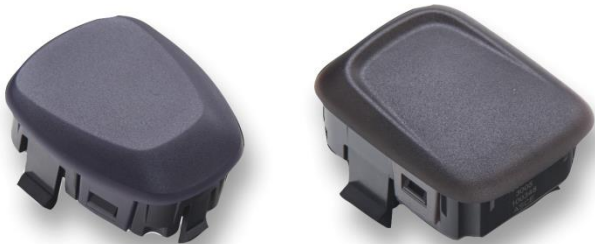
Figure 1: Multizone Solar Sensors