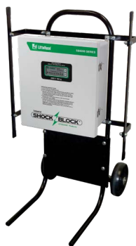
AC6000-CART-00 Two-wheeled Cart Optional for mounting ISB to allow for moving the unit while power is off