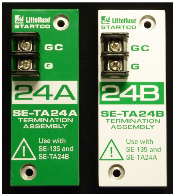
Figure 3: SE-TA24A and SE-TA24B Termination Assemblies