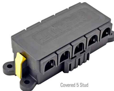
Covered 5 Stud