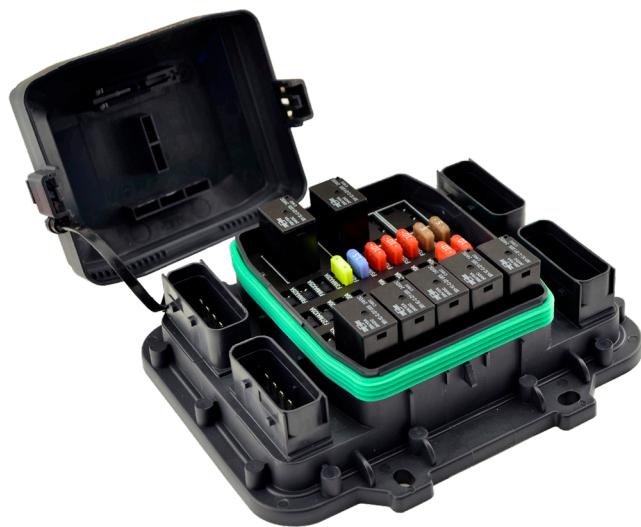
*Fuses and Relays Not Included