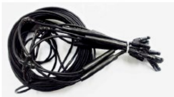
Figure 1. Wiring harness made by Hikam America has eight branches, each protected by a Littelfuse supplied in-line DC fuse.

Even more important, the wire harness with in-line fuses offers dramatic cost reductions for EPCs and project investors. By fusing in-line instead of in the combiner box, the harness reduces the total number of inputs into a combiner box. Multiple protected strings are combined in the harness, having fewer inputs with higher ampacity coming into the box.